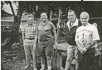
First Annual Delaware Bay Lighthouse Keepers Reunion August 6, 1995