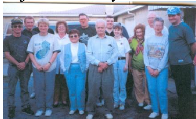
One of the 1 st Organizational Meetings- at Alloway, NJ