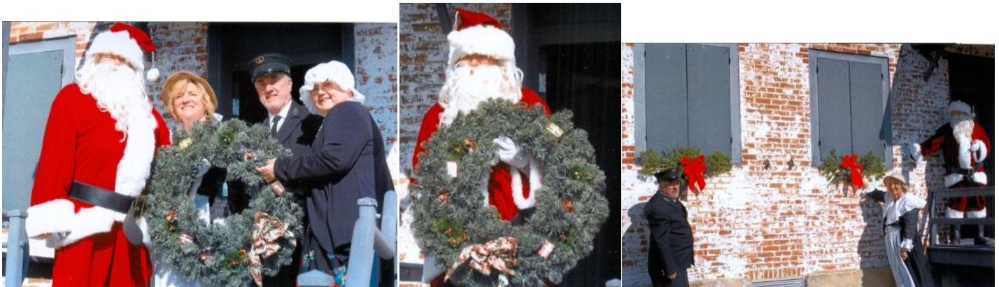
Santa, Mrs Santa w/Keeper and wife Santa delivering wreath Keeper and wife decorating

Christmas is a joyous time, going to church in Port Norris, shopping trip by wagon to Millville and preparations for a holiday dinner. Wild turkey, rabbits curing in the cellar along with many vegetables from the garden. Fresh beets, potatoes, herbs, many varieties of beans and corn, some dried some mother preserved, pumpkin, fresh cranberries from the bog over near Maurice River Lighthouse .If the water isn't too cold we may even have clams and oysters for a hearty soup. Our friends at Maurice River plan to share some venison and salted cod fish. We will cut down a scrub pine and the girls will gather up holly and bayberrys for decorations. The boys will grind up some of the bayberries and add them to tallow to make window candles and they will make sure we have an abundance of wood in the wood shed for the fireplace and stove. Mother will be cooking for days on our great new black iron wood stove. The smell of freshly baked bread and biscuits, can't forget the pies, especially the pumpkin and dried apple. Each night before and after dinner we take turns reading chapters and verses from our Bible. Mother and the girls have sewn new dresses and pants, shirts for the boy's and father (Keeper).for Christmas. Father's duties as Keeper will keep him busy as it always snows for Christmas.