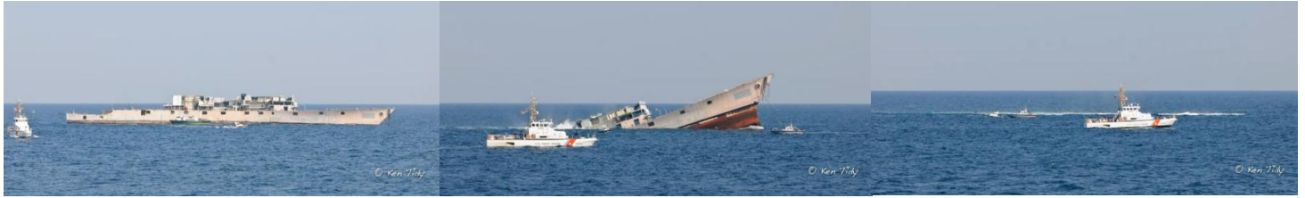
Sinking off Indian River Inlet Delaware